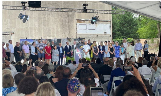
Victims’ families, survivors, first responders and others breaking the glass houses