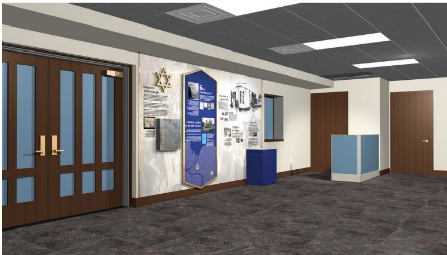
VIEW 1-DRAFT 09-20-21

We have received the proposal for the historical display at the New Light Memorial Chapel from Shibui Designs. The display seeks to capture our more than 100-year history from our foundation