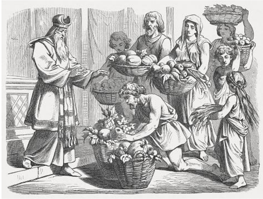
Blessing of the First Fruits