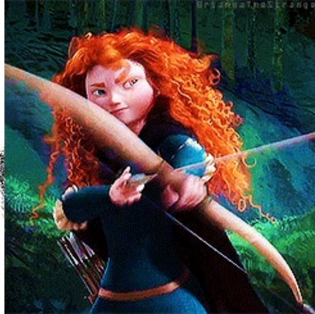
Rabbi Akiva (50-135)